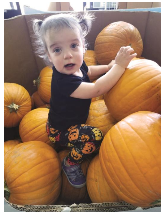
Growing and developing!

While parenting a toddler with HLHS has many challenges, it also comes with many rewards. As your child grows, each new experience is appreciated and every milestone met is celebrated. Your child is an example of resilience and determination to every person they meet. Take time to enjoy the present moment with your child and family, and take comfort in knowing there are many people encouraging you along the journey.