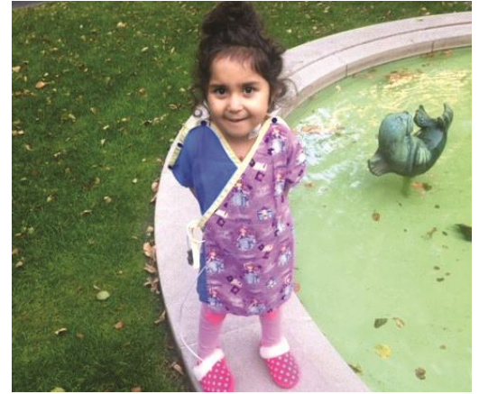
It's a balancing act!

"Sometimes I think about how many doctors were treating my daughter during interstage versus today. I am finally starting to appreciate the space we have right now to treat her like a regular kid who needs to sleep and eat her veggies, but know that there is a team of people who will always help when I am a concerned mama."