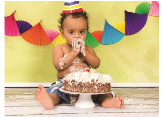
Making a mess is so much fun!